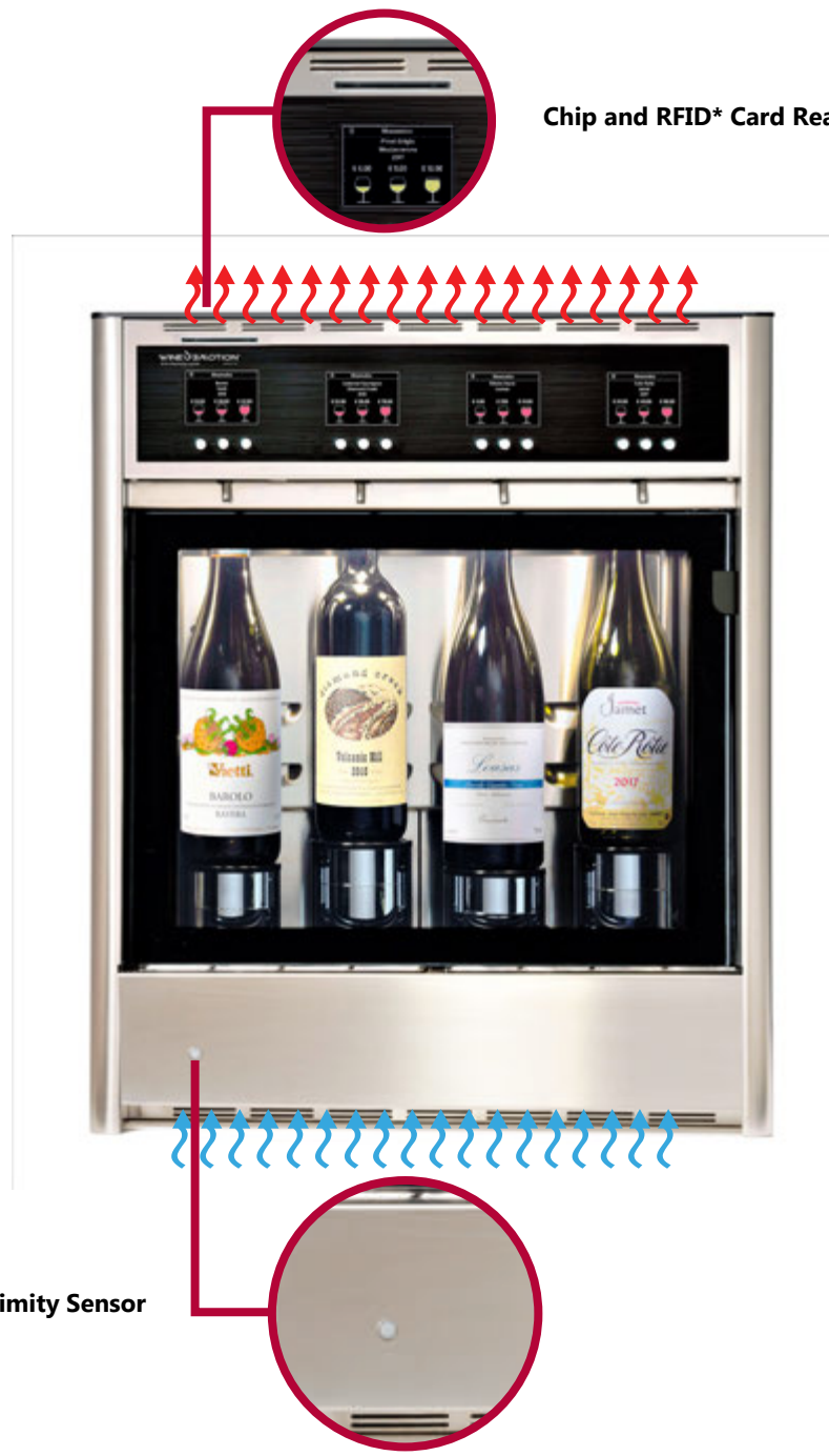
Chip and RFID* Card Reader