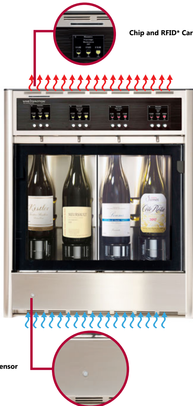
Chip and RFID* Card Reader